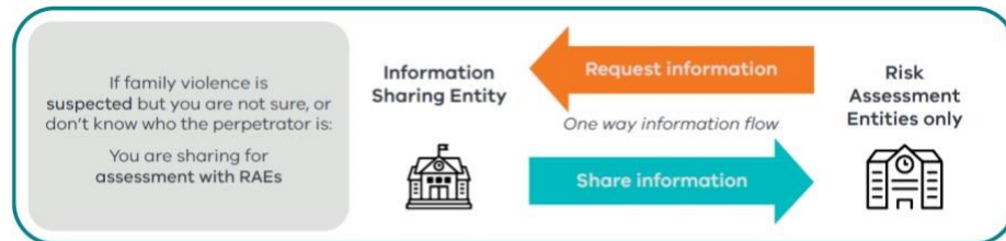
Figure 1: Overview of activities when sharing information for risk assessment

Family violence risk assessment is an ongoing process and is required at different points in time from different service perspectives. Education and care services will have a role in working collaboratively with other services to contribute to ongoing risk assessment and management of family violence.